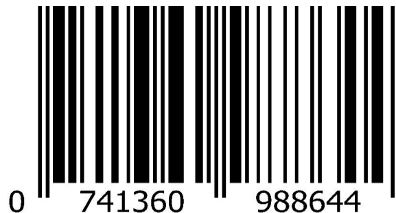
Figure 5. Barcode (Google, 2023)

The information in the barcode is extracted as shown below.