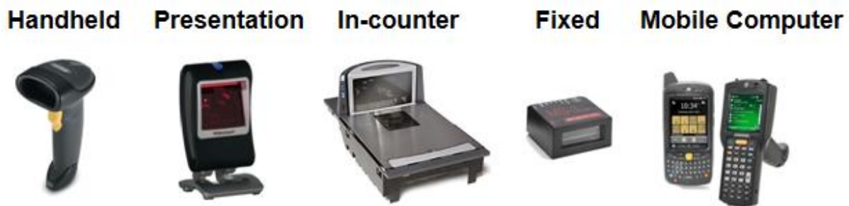
Figure 3. The decoder (Google, 2023)

The Barcode scanner start by illuminating the code with a red light. The converter/sensor will now detect the reflected light from the illumination system and generates an analog signal with varying voltage that represents the intensity of the reflection. The converter changes the analog signal to a digital signal, which is fed to the decoder.