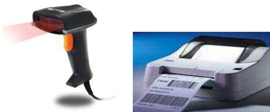
Figure 4. Decoder and printer (Google, 2023)